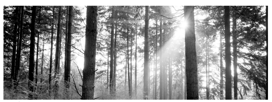
There are special people in our lives who never leave us, even after they are gone.