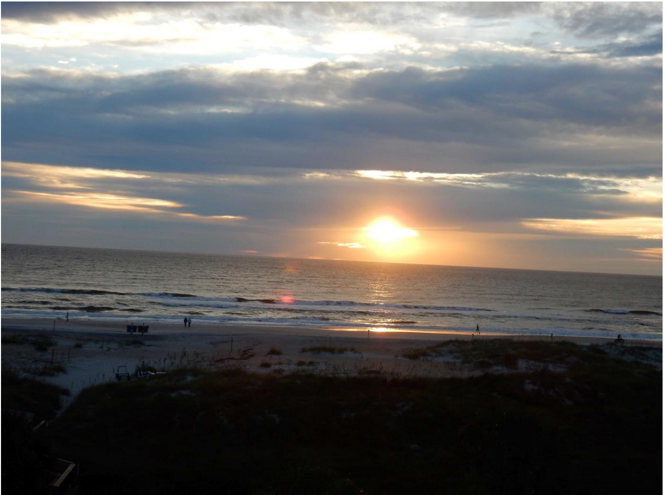
Sunrise in St. Augustine

2023 AFSA Convention The Guy Harvey Resort St. Augustine Beach, Florida October 8-11, 2023